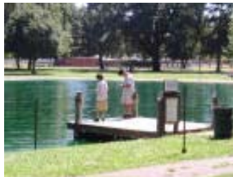
Fishing on the Lake