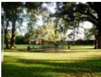
Picnic Site 6A

*Please be advised that glass bottles are not allowed in the park.*