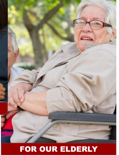
FOR OUR ELDERLY