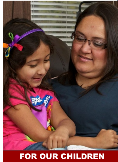
FOR OUR CHILDREN