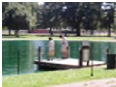
Fishing on the Lake