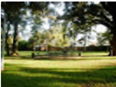
Picnic Site 6A

*Please be advised that glass bottles are not allowed in the park.*