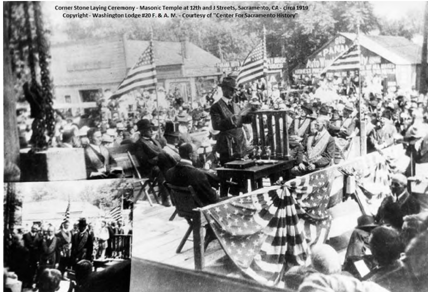
Corner Stone Laying Ceremony - Masonic Temple at 12th and J Streets, Sacramento, CA - circa 1919