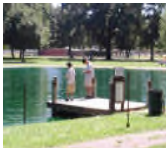
Fishing on the Lake