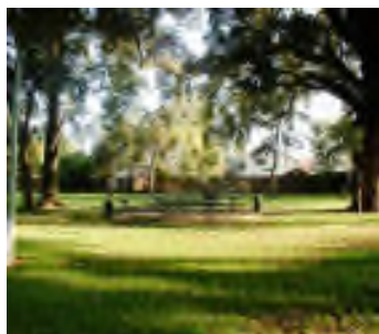
Picnic Site 6A

*Please be advised that glass bottles are not allowed in the park.*