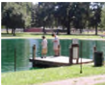
Fishing on the Lake