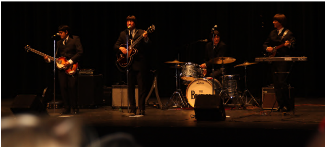
Our Ladies Night entertainment performing at the 2013 Eastern Star Grand Session