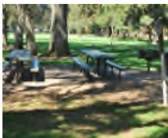
Picnic Site 3B