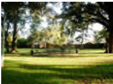
Picnic Site 6A

*Please be advised that glass bottles are not allowed in the park.*