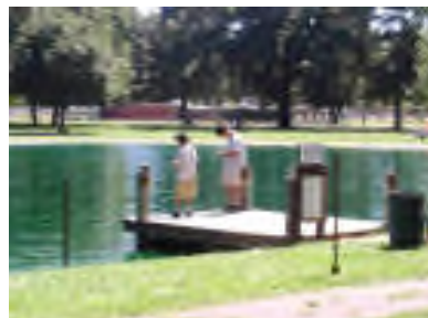
Fishing on the Lake